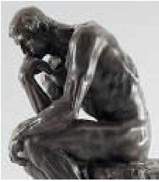
Rodin The Thinker