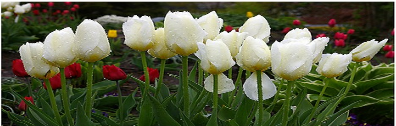
"April showers bring May flowers"

*****June 6th, ANNUAL CONGREGATIONAL MEETING*****