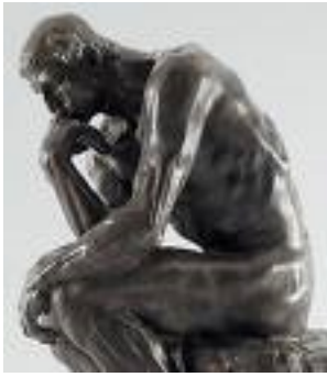
The Thinker, Auguste Rodin